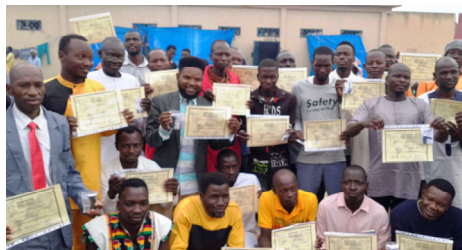
31 pastors commissioned in Chad

Praise God for His blessing on the Romans Project Ministry. Please pray for the RP leaders and directors in their administration of the RP. Pray also that the Lord will provide the added financial support to keep up with and continue the expansion efforts into new countries and regions.