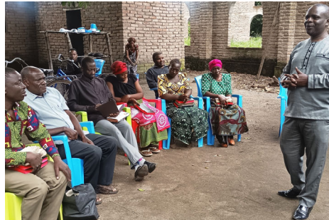
Church in Ngeleka